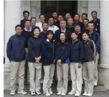
The visiting Chinese officials

The aim of the programme was to select 50 Chinese Line Umpires for the Beijing Games in two years' time. Six of the officials selected for Wimbledon qualifying were also chosen to work as Line Umpires for the main draw of Wimbledon.